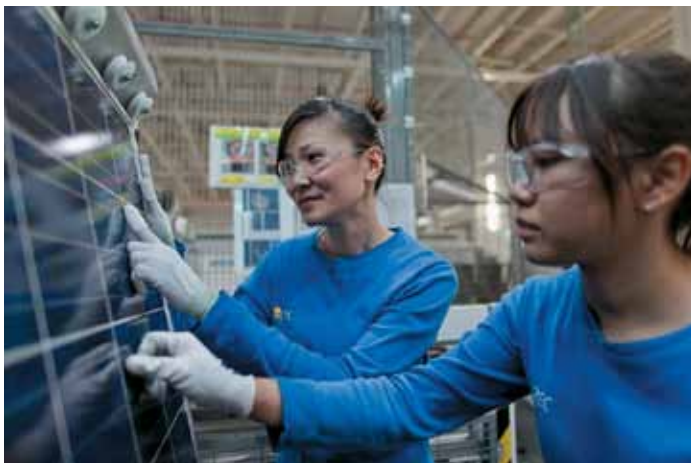
REC Module Tuas Singapore

Since 2005, Photon Lab has operated an ongoing test that monitors the energy yield of solar modules from leading manufacturers. This test compares the energy produced per kilowatt of installed power of the participating modules, under identical conditions.